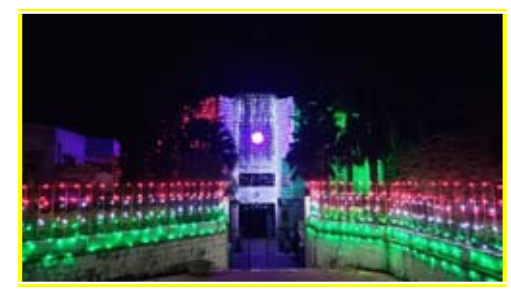
Tricolour illumination of Centre – International Museums Day