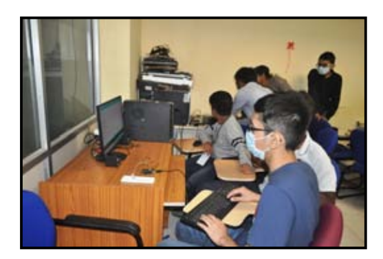
Workshop on 'Internet of Things in May 2022 at VITM