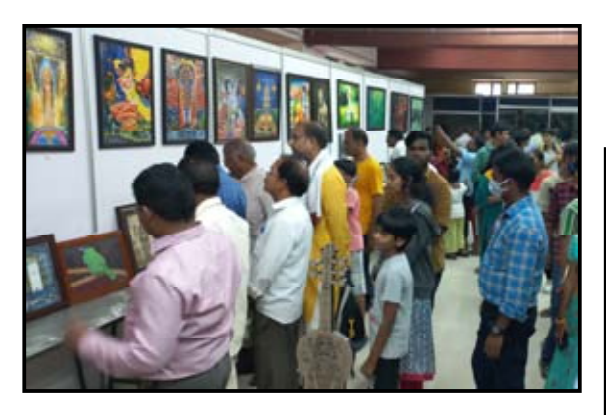
Art Exhibition organised at RSC, Tirupati May, 2022 during International Museum Day week