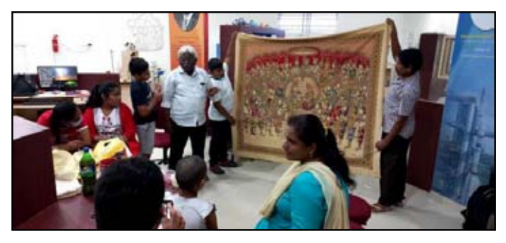
A Workshop on Kalamkari organised at RSC, Tirupati during International Museum Week