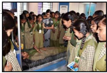
Visit of underprivileged children to the centre - interacting with the exhibit

Visits of underprivileged children to the centre were organized during the year in collaboration with State Education Department. During the visit, "guided tour' to various galleries of science centre including Science Park, science show, 3D show and Heart beat rate demonstration were conducted for the benefit of the students. In addition science kits and refreshments were also distributed to the children. 1,383 children and 138 teachers participated.