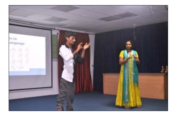
Science Signbee workshop held at VITM