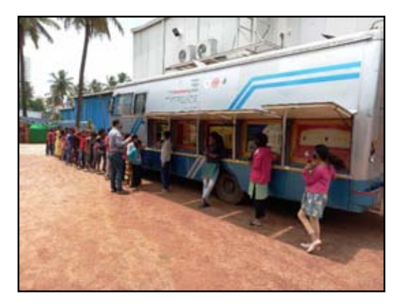
Mobile Science Exhibition on the theme 'Electricity & Magnetism at Victory International, AG Worship Centre, Kempapura Bangalore