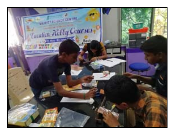
Summer Vacation Hobby Course on 'Electronics' at DSC-T