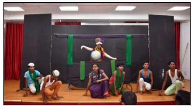
District level Science Drama contest on 'Science and Technology for the benefits of mankind' at DSC G in association with DIET Kamalapur, Kalaburagi