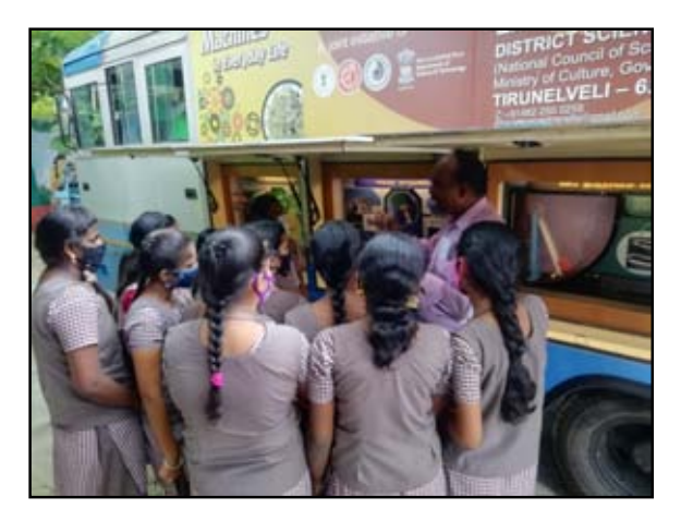
Mobile Science Exhibition programme at Vallikkunnu fest by RSCP C

Mobile Science Exhibition programme at Saranalayam Orphanage Home, Tirunelveli by DSC T