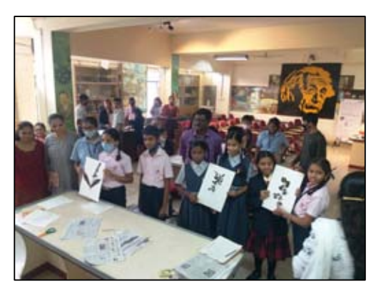
Herbarium workshop held at VITM