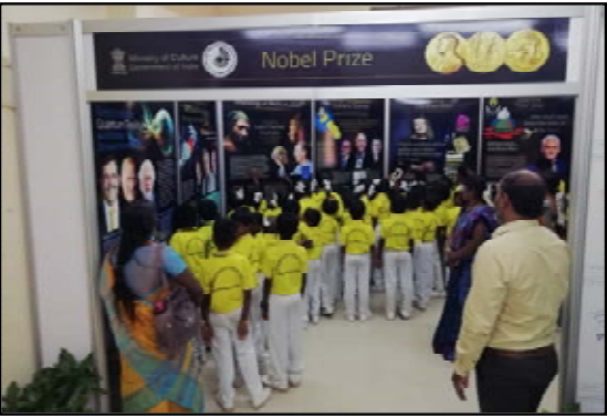
Temporary Exhibition on 'Nobel Prizes 2022' at DSC-T