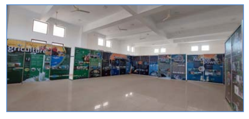
Temporary Exhibition Hall