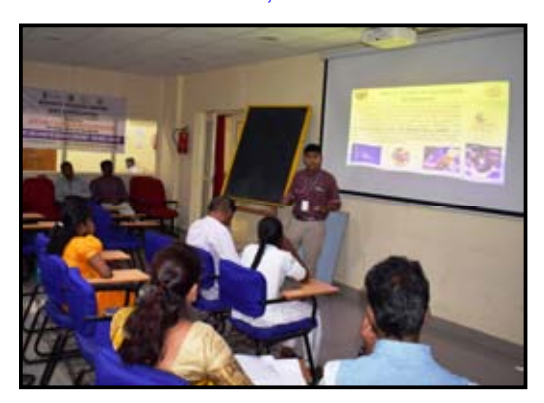
Dist. Level Science Seminar held at DSC G