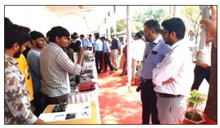
Participants interacting with visitors during Malabar STEM fair

Malabar STEM Fair was organised at this centre on 27<sup>th</sup> & 28<sup>th</sup> February 2023. The fair provides a platform to all students studying in schools, ITI, Polytechnic, and College to showcase their germinated ideas in form of a product or a prototype design. 26 projects were displayed in the exhibition by 60 students.