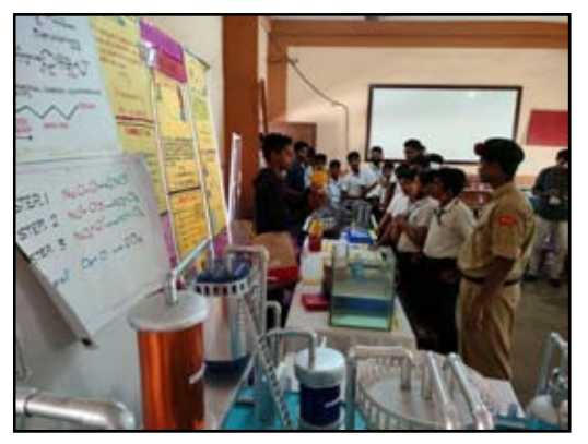
Participants interacting with visitors at Southern India Science fair organised by VITM at Thrissur