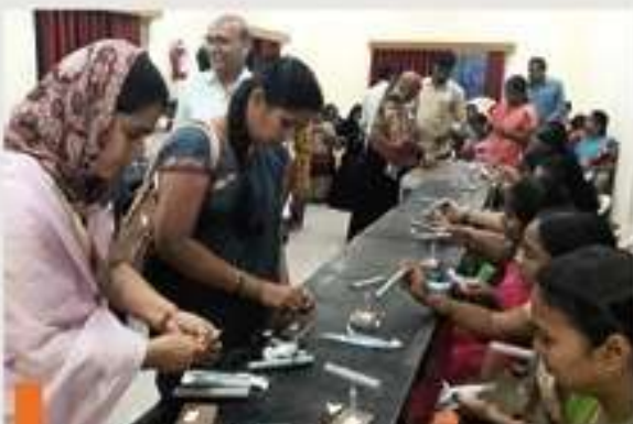
Teachers workshop at DSC G