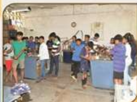
Vacation Hobby Course in Physics at VITM