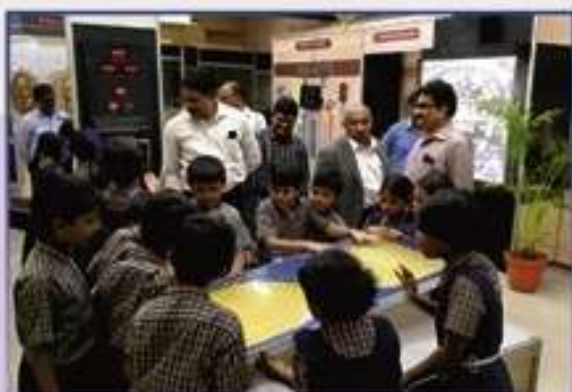
Statistics at Work Exhibition at RSC T