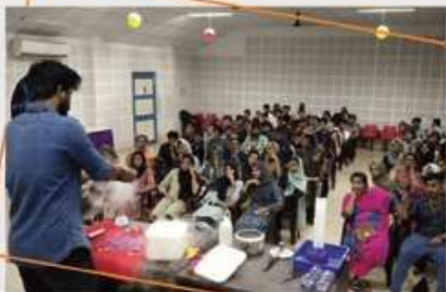
Science show at RSC & P C