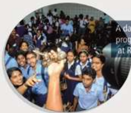
A day with snake programme at RSC P & C