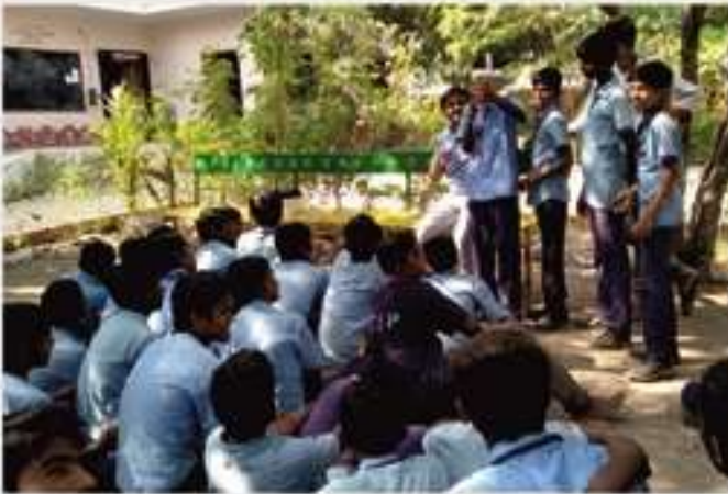
V R demonstration