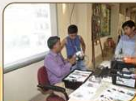
Vacation Hobby Courses in Robotics at VITM