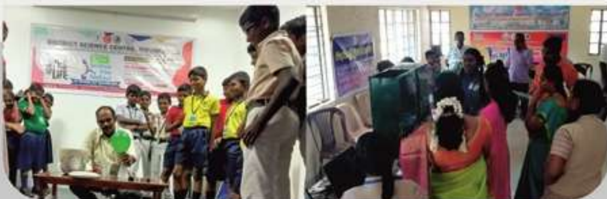
Science Film Festival workshop at DSC T