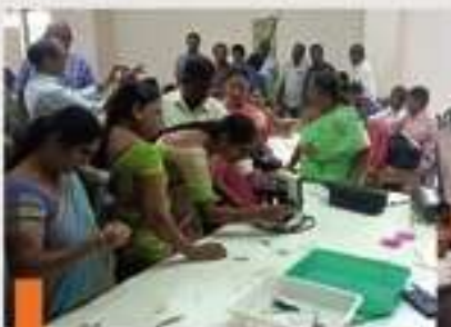
Teacher Training programme at RSC T