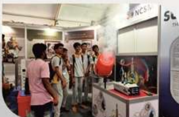
NCSM Pavilion during 107th Indian Science Congress at GVKK campus Bengaluru