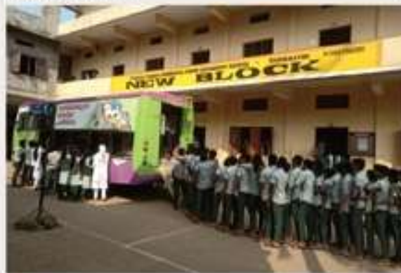
RSC & P C MSE programme in Aspirational Districts of Kerala