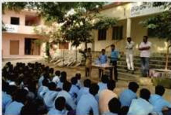
DSC G Science Demonstration during MSE