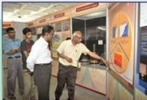
Statistics at Work Exhibition at VITM