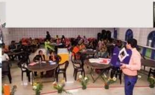
Teacher Training programme at RSC & P C