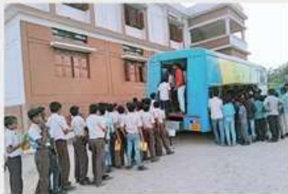
DSC G MSE programme in Aspirational Districts of Karnataka