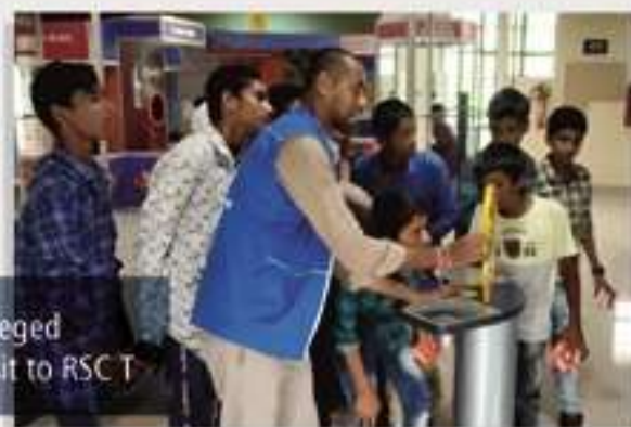
Under Privileged Children Visit to RSC T