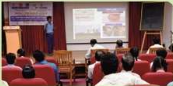
District Level Science Seminar at DSC G