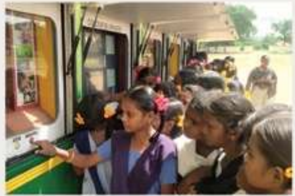
RSC T Mobile Science Exhibition