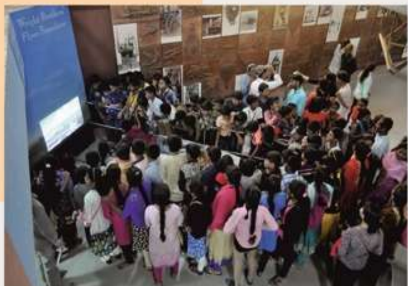
Wright brothers Flyer Simulator at VITM