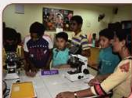
CAC Electronics at DSC G