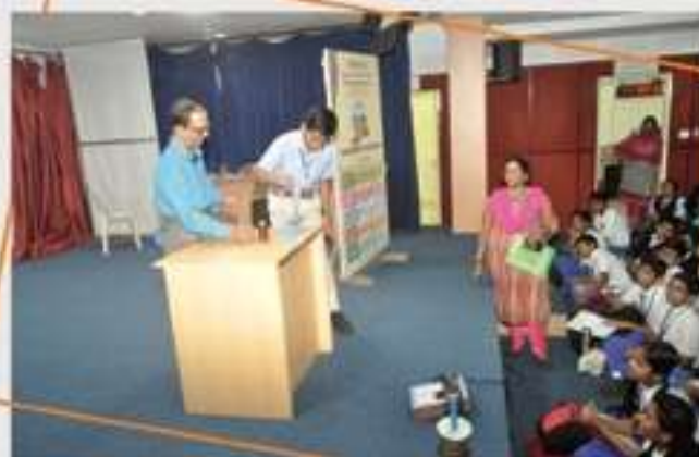
SDL on Chemical Reactions at VITM