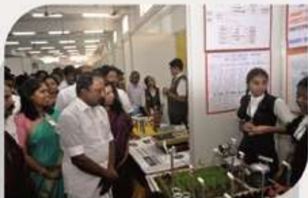
Southern India Science Fair organized by VITM