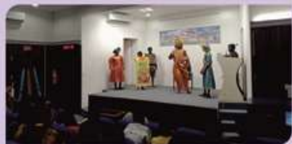
District Science Drama Contest at DSC T