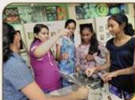
Vacation Hobby Centre - Chemistry at VITM