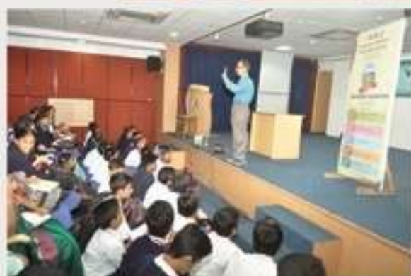
Science Quiz during 54th Anniversary of VITM