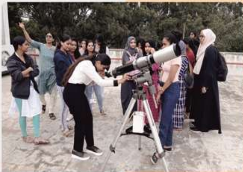
Sky Observation at VITM