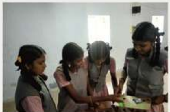
DSC T Model making workshop during MSE