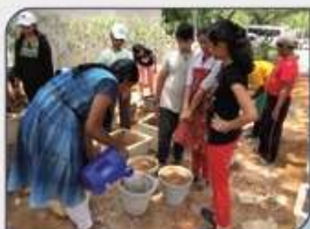
Summer Camp Gardening at RSC T