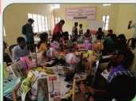
VHC Art Crafts at DSC T