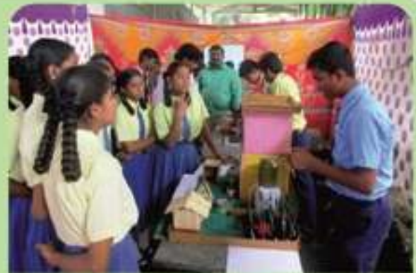
District Level Science Fair at DSC G