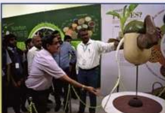
Traveling Exhibiton on pulses at DSC G