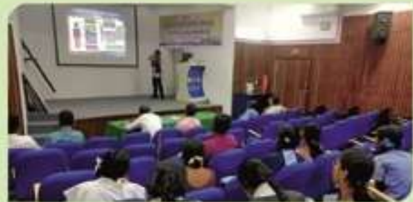
District Level Science Seminar at DSC T