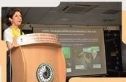
Talk by Dr. Fabiola Gianotti, D.G., CERN on Fundamental Research at CERN organised at VITM