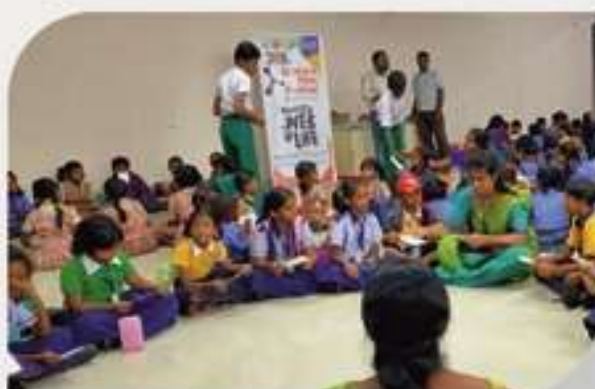
Science Film Festival activity at RSC T