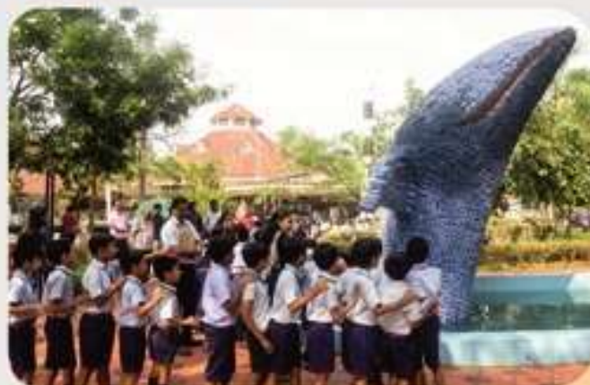
Art Installation at RSC & P C