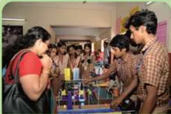
Sub District Science fair at RSC & P C