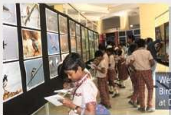
Wetland Birds Exhibition at DSC T