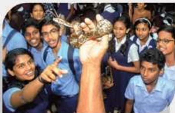
'A day with snake' programme at RSC & P C