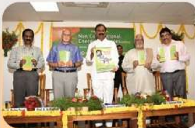
New Gallery on Non Conventional Energy Resources at RSC T