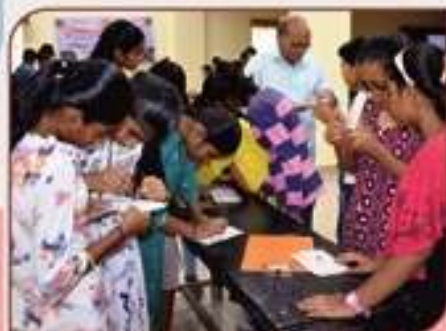
CAC Electronics at DSC G