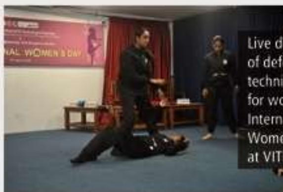
Live demonstration of defence techniques for women during International Womens Day at VITM