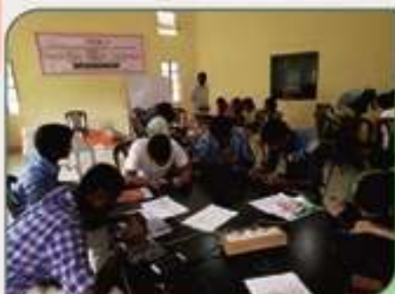
VHC Electronics at DSC T