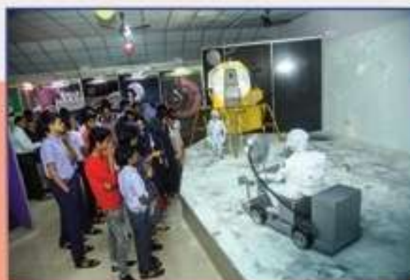
Exhibition on Touch down Moon at RSC & P C