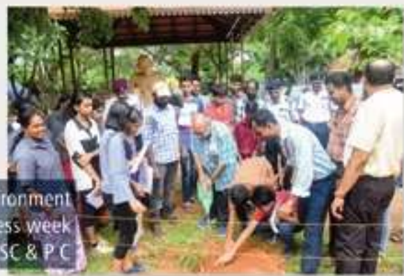
Environment awareness week Tree planting at RSC & P C