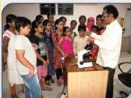
Summer Camp Bioscience at RSC T