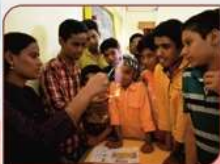
CAC Chemistry at DSC G