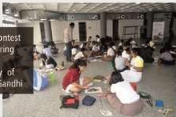
Drawing Contest at VITM during 150th Birth Anniversary of Mahatma Gandhi