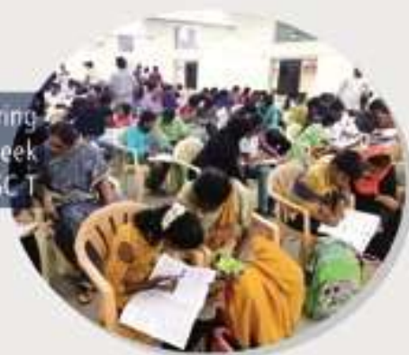
Family Quiz during World Wildlife week at DSC T