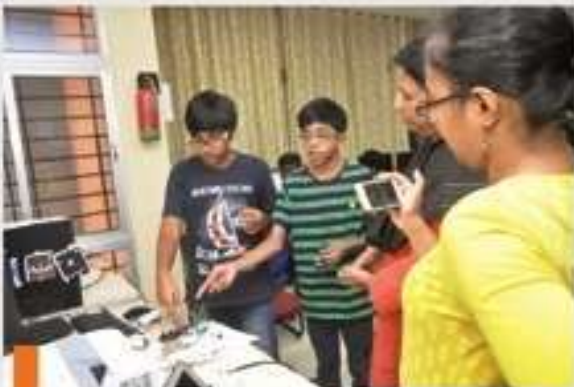
Workshop on Arduino at VITM