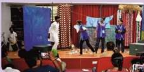
District Science Drama Contest at DSC G