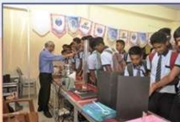
Vigyan Samagam ITER Week at VITM live plasma demonstration & models of plasma applications