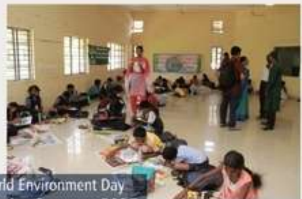
World Environment Day Drawing Contest at DSC T