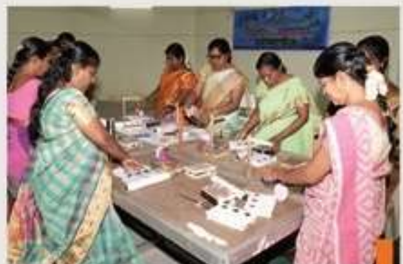
Teacher Training programme at DSC T