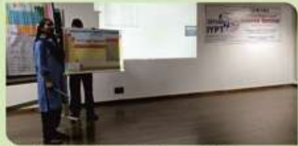
District Level Science Seminar at RSC T