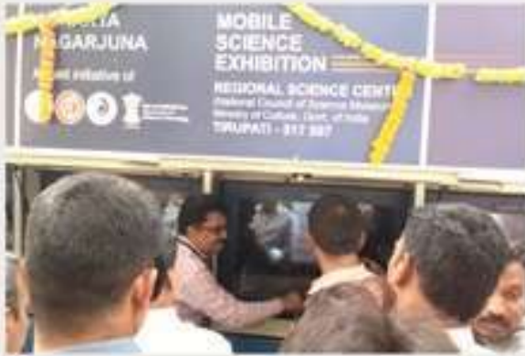
RSC T New MSE Bus in Aspirational Districts of Andhra Pradesh