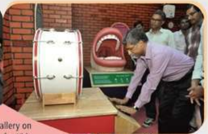
New Gallery on Science for Kids at VITM