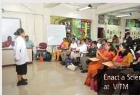
Enact a Scientist contest at VITM