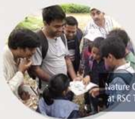
Nature Camp at RSC T