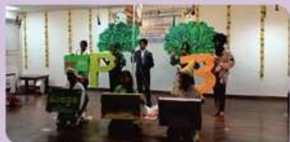
State Level Science Drama Contest at RSC T