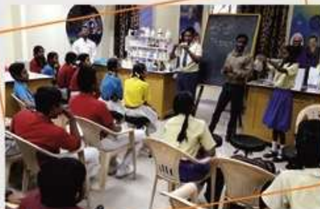
Science Show at DSC G