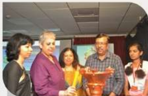
Inauguration of Science Film Festival at VITM