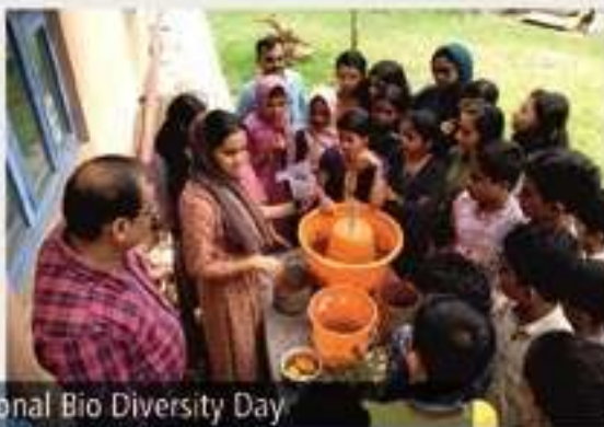
International Bio Diversity Day Vermicompost Demonstration at RSC & P C