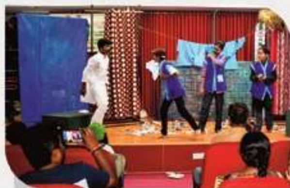
District level Science Drama Contest at DSC G