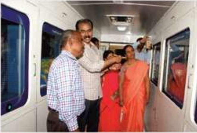
VITM MSE on Space Technology in Yadgir (Aspirational District of Karnataka)