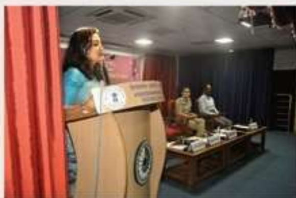
International Womens Day at VITM