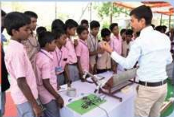
Innovation Festival at RSC T