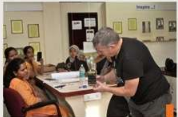
Teachers Training Programme at VITM