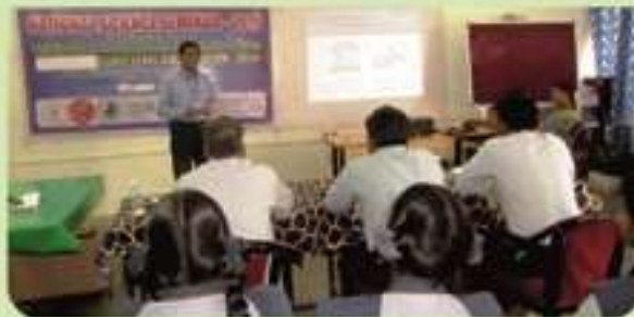
Puducherry State Science Seminar