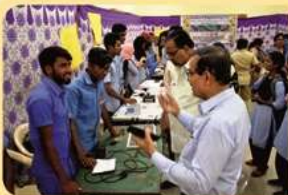
Electronics fair at DSC G