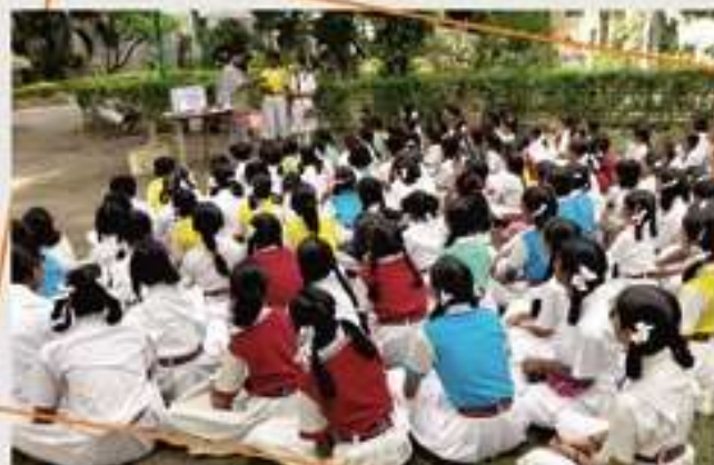
Science Show at DSC G