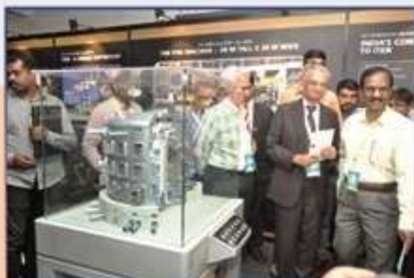
Vigyan Samagam - Inauguration Programme at VITM