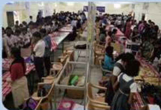
Innovation Festival at DSC T