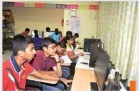
App Development on Android at VITM