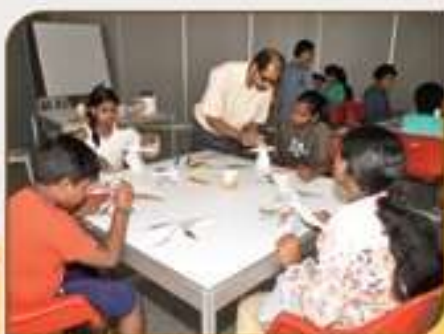
Vacation Hobby Course in Art & Science at VITM