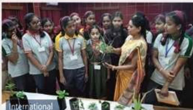
International Science Centre & Science Museum day at DSC G