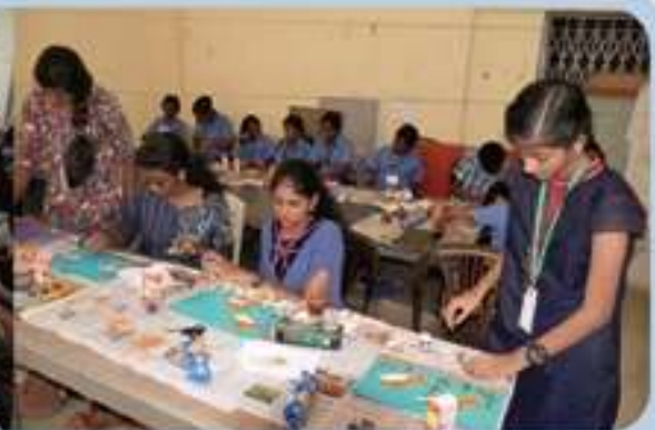
Workshop during Innovation Festival at DSC T