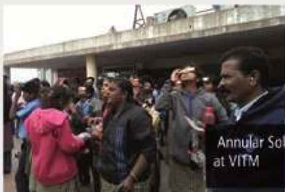
Annular Solar Eclipse at VITM