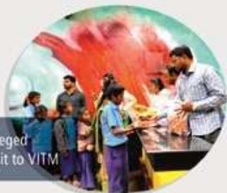
Under Privileged Children Visit to VITM