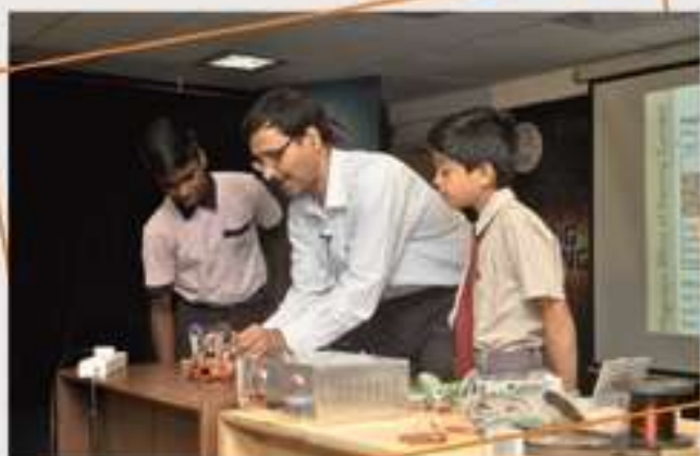
SDL Mag eff of electric current at VITM