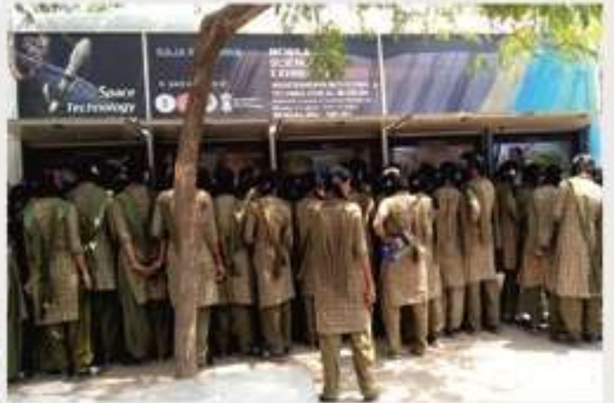
MSE in schools