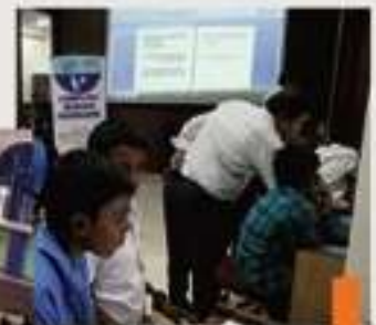
Computer Training programme at RSC T