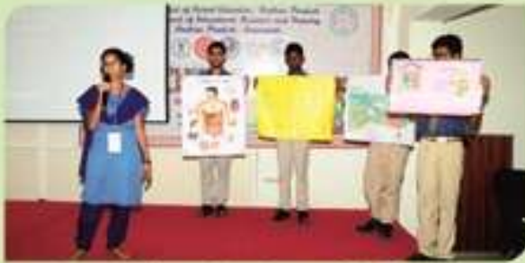
State Level Science Seminar at RSC T