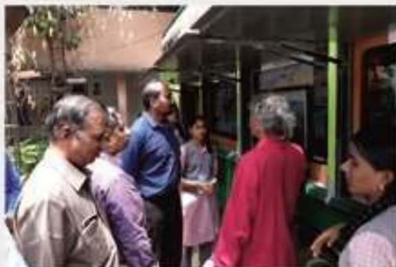
DSC T MSE programme in Aspirational Districts of Tamilnadu