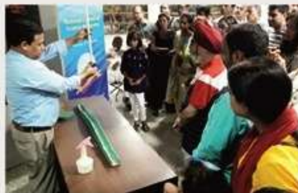
Science Show at VITM