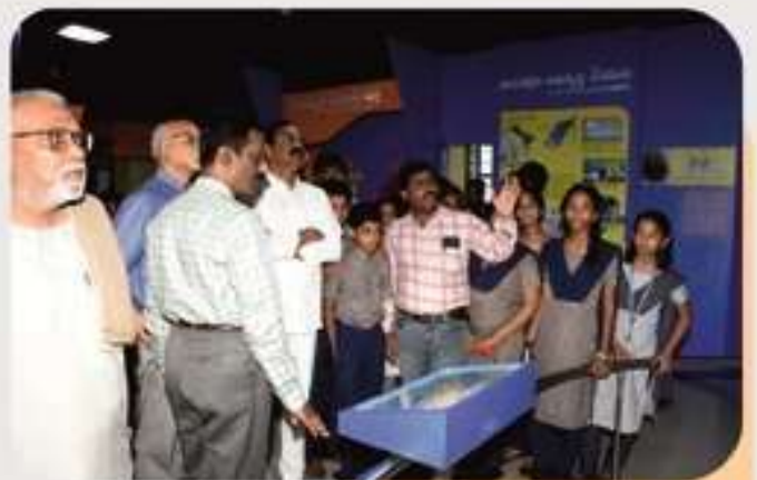
Non Conventional Energy Resources Gallery at RSC T