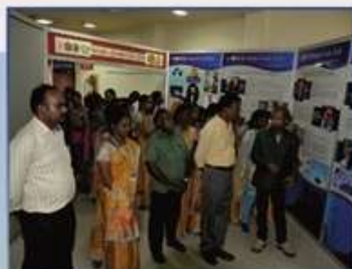
Exhibition on Nobel Prize 2019 at DSC T