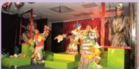
Southern India Science Drama Festival at VITM