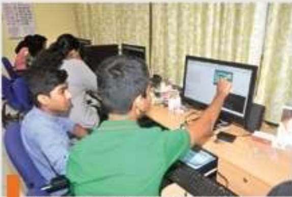
Workshop on Raspberry Pi at VITM